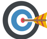
Accuracy (or Effectiveness)